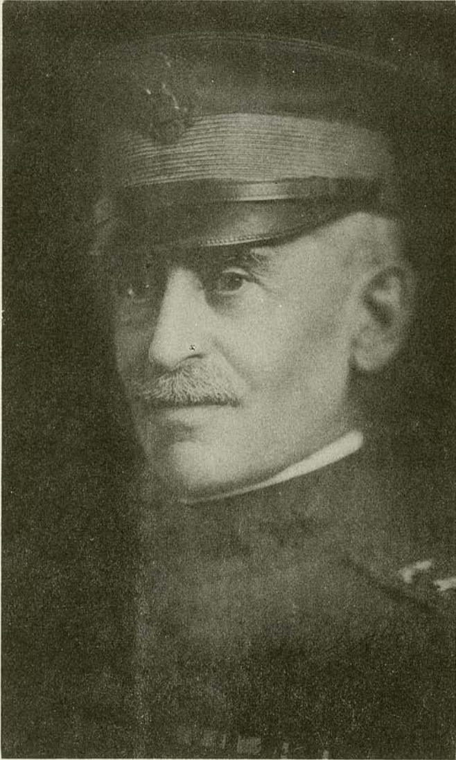
ENOCH H. CROWDER Major General, U. S. Army