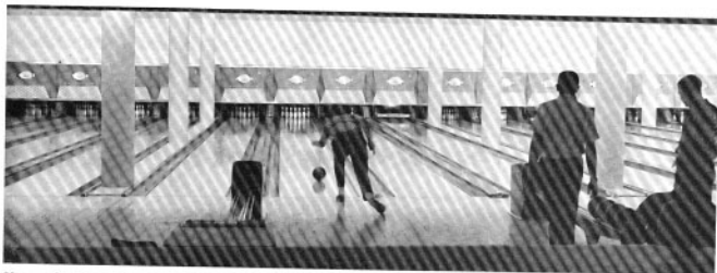
Sixteen bowling lanes are located in the basement. Billiards are also available in the games area. Both are innovations in student recreational facilities at the University.