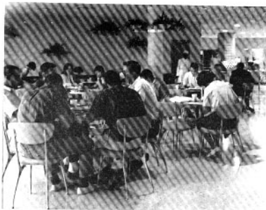
The attractive decor also extends to the snack bar on the main floor. The University Book Store has permanent quarters across the corridor.