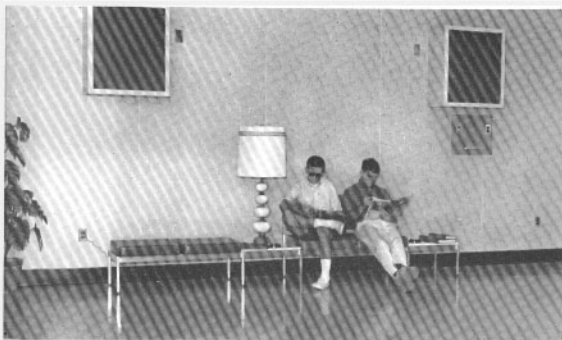
A small area of the listening room where students may relax to the accompaniment of music they may select from a library of classical recordings.