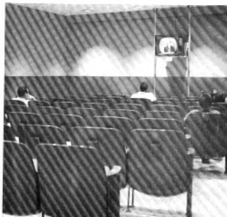
Color television, and 80 seats from which to view it, are provided on the second floor.