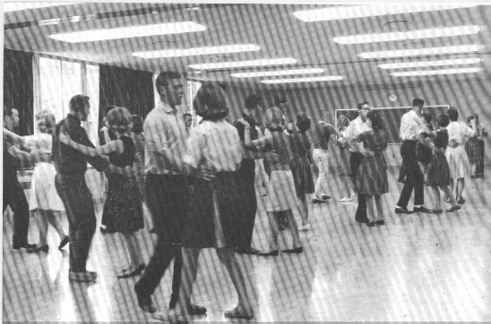
This room, one of the most spacious in the Student Commons, is adaptable to a variety of functions, such as lectures, conferences and demonstrations. On this occasion freshman and sophomore students were receiving social dance instruction in a physical education course.