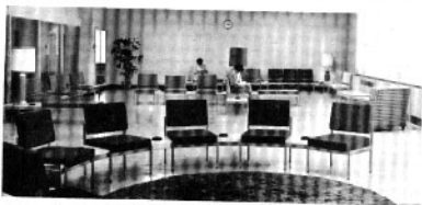
A favorite spot is the inviting browsing lounge with its tasteful furnishings and sweeping view of the south campus.